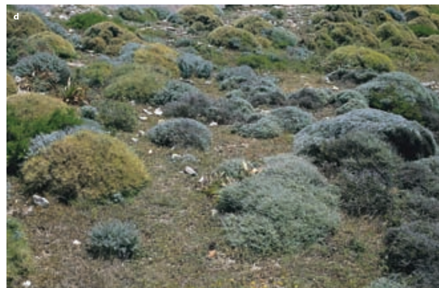
Figure 1. Examples of European habitats prone to invasion: (a) ruderal vegetation (Slovenia), (b) riverine scrub (Sicily, Italy) and resistant to invasion: (c) alpine vegetation (Belianske Tatry Mts, Slovakia), (d) Mediterranean heathland (Korsica, France).